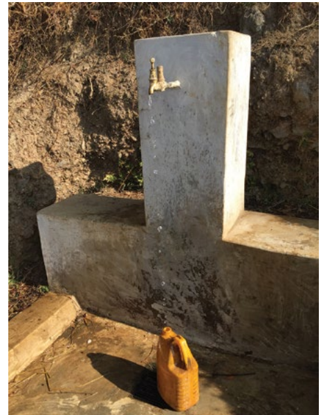
A shared water tap in rural Nepal